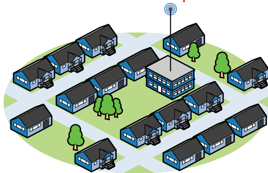
Clubhouse with Access Point