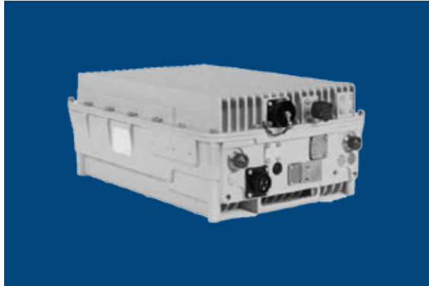
8200: Mobile WiMAX ODU with integrated 2TX and 2RX

ASN specifications of Mobile WiMAX define the interoperability among end-user devices, Base Stations and the CSN infrastructure including authentication, control of user services and mobility management. The 6000 Series integrates seamlessly with the EION industry award-winning Wireless Services Gateway (WSG) for full featured service provider networks and the lightweight ASN Express and EION AAA Express for enterprise applicaitons.