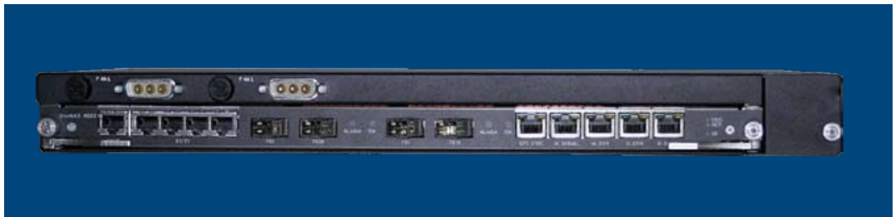
StarMAX 6100 Base Station

The 8200 ODU unit serves as the high TX power radio for each sector. Each 8200 has two transceivers in the same housing to support 2x2 MIMO with a single ODU unit. For maximum radio performance two separate cables are used: one optical for IDU/ODU interconnection and one copper power supply cable for powering the ODU. Using an optical cable for IDU/ODU interconnection eliminates all of the attenuation, signal loss and performance reduction that happens with systems using coax connections. Both cables have weather-proof connectors.