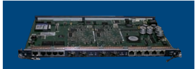
6022: Mobile WiMAX IDU serving 2 sectors MIMO A/B Matrix

The 6022 can be fitted with one or two 16e PMP daughter boards, each serving one sector with MIMO. Up to four of these blades can be placed into the 6400 chassis, enabling operation of up to eight sectors—with or without MIMO. IDU/ODU connection is realized through an optical interface.